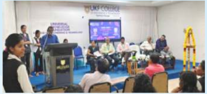
View of lighting of the lamp and the dias

The IEI Students' Chapter, Electrical and Electronics Engineering Department of Pragati Engineering College conducted a Seminar on "Heinrich Rudolf Hertz" on 22 Feb 2023 to commemorate on his Birth Anniversary.