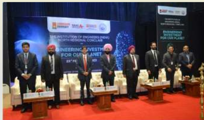
View of the dias