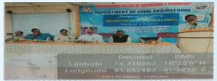
View of the dias during the program

The IEI Students' Chapter, Civil Engineering Department of Swarnandhra College of Engineering and Technology was inaugurated on 4 February 2023.