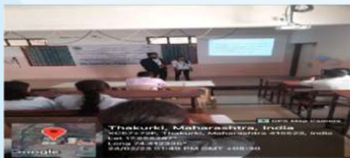
View of participants during the program