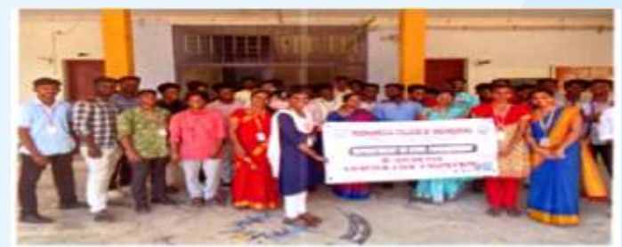
View of participants during the lecture program

The IEI Students' Chapter, Civil Engineering Department of Mookambigai College of Engineering conducted a Special Lecture on "Recent Trends in Civil Engineering" on 21st February 2023.