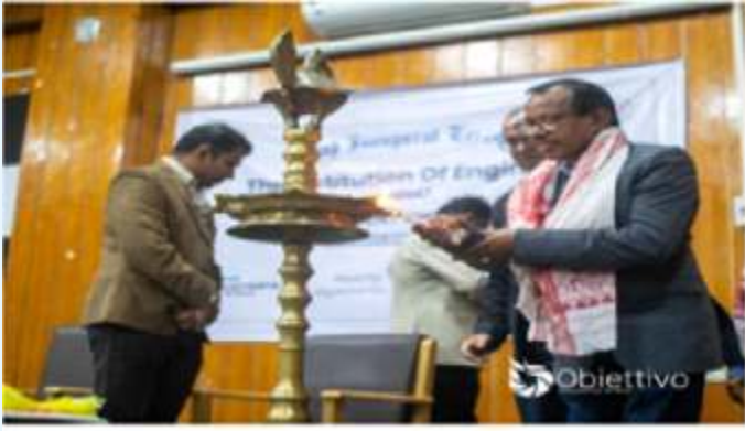
View of lighting of the lamp during the inauguration