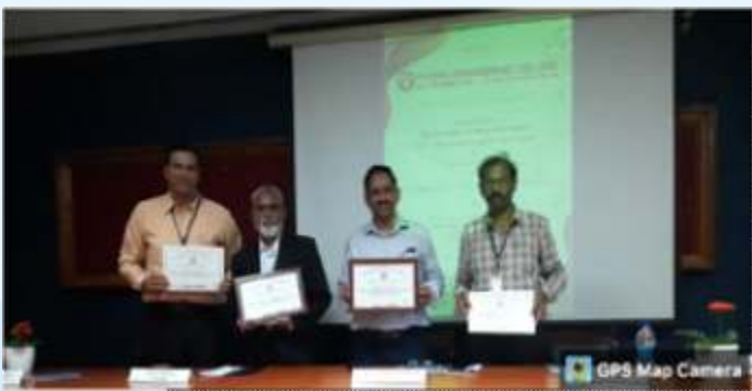
View of the dias

The IEI Students' Chapter, Department of Mechanical Engineering of Raghu Engineering College was inaugurated on 29 December 2022.