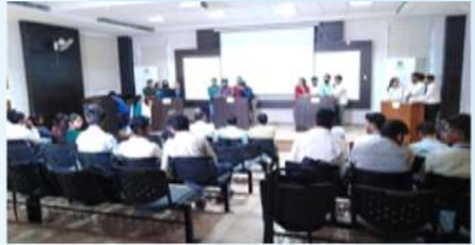
View of participants during the program

The IEI Students' Chapter of Anand International College of Engineering celebrated "National Science Day(NSD)" followed by guest lecture, project exhibition and technical quiz competition on 28 February 2023.