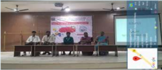
View of the dias during the seminar

M.A.M.College of Engineering and Technology organized One Day Seminar on "The Future of Robotics Technology" on 17 February 2023.