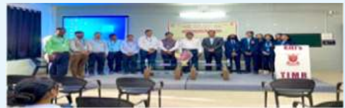
View of the dias during the inauguration program

The IEI Students' Chapter of Trinity Polytechnic was inaugurated on 16 February 2023.