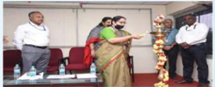
Lighting of the lamp during the program

The IEI Students' Chapter, Department of Aerospace Engineering of SRM Institute of Science and Technology organized one day national seminar on "Trends on Future of Aviation" on 8 March 2023.