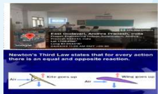
View of speaker during the program