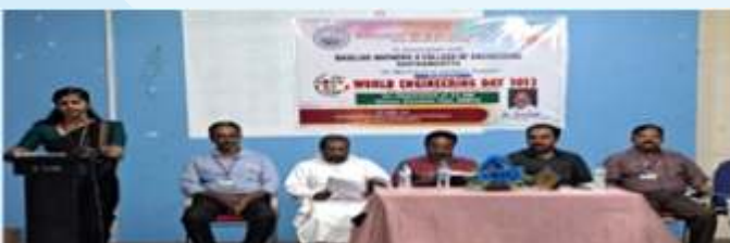
View of the dias during the program

The IEI Students' Chapter, Mechanical Engineering Department of Baselios Mathews II College of Engineering celebrated World Engineering Day 2023 on 6 March 2023.