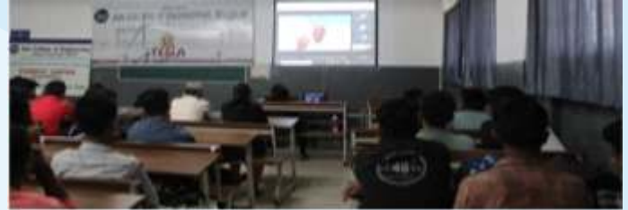
View of the dias during the program

The IEI Students' Chapter, Electrical & Electronics Engineering Department of Jain College of Engineering celebrated National Science Day on 28 February 2023.