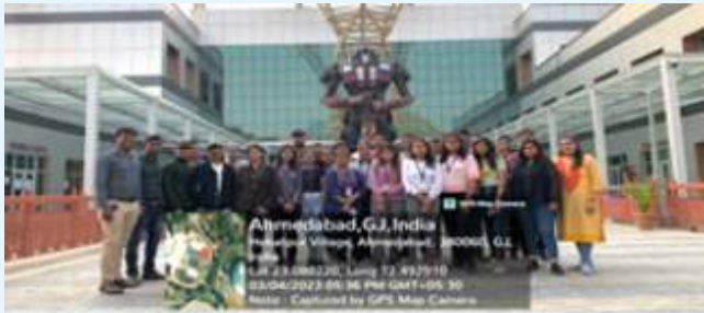
View of the participants

The IEI Students' Chapter, Civil Engineering Department of B V M Engineering College organized a Technical Visit to L & T Construction Skills Training Institutes (CSTI) and Science Carnival 2023, Ahmedabad on the subject "2 CE05-Construction Technology" on 4 March 2023.