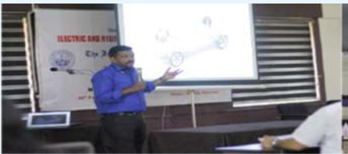
View of the apeaker during the seminar

The IEI Students' Chapter, Mechanical and Electrical Engineering Department of NSS College of Engineering conducted a seminar on "Electric and Hybrid Vehicle" on 24 February 2023.