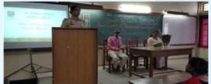
View of the dias during the event

The IEI Students' Chapter of Government Polytechnic organized Expert Lecture, Industrial Visit, Technical Quiz Competition and Technical Events.