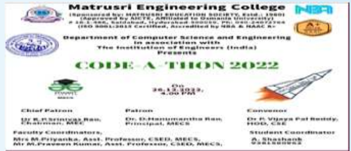
Flyer of the event

The IEI Students' Chapter, Computer Science & Engineering Department of Matrusri Engineering College organized an Online Event "CODE-A-THON" on coding contest on C Programming, Python Programming, Java Programming on 26 December 2022.