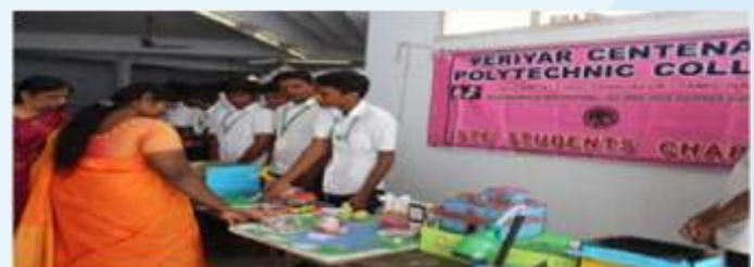
View of participants during the program

The IEI Students' Chapter of Periyar Centenary Polytechnic College organized Project Exhibition namely "Periyar TechnoExpo-2023" on 13 January 2023.