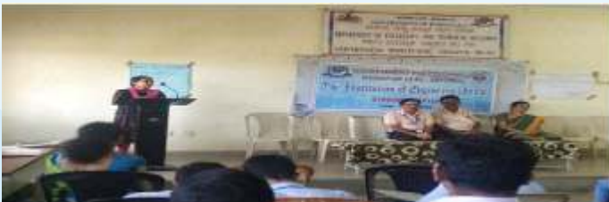
View of the dias

The IEI Students' Chapter of Government Polytechnic organized Technical Exhibition and Quiz Competition on 5 January 2023.