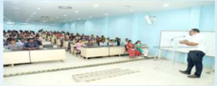
View of participants during the program

Synchronization" on 7 July 2022. The Chapter also organized Seminar on "Design of Controller for Unified Power Flow Conditioner" on 16th February 2023.