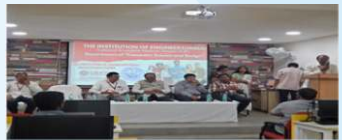
View of the dias during the inauguration

The IEI Students' Chapter, Computer Science & Design Engineering Department of S R K R Engineering College was inaugurated on 21 February 2023.