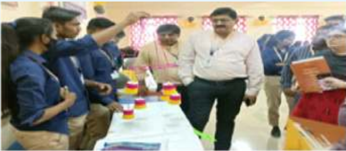
View of participants during the program

The IEI Students' Chapter, Electrical Engineering Department of G H Raisoni Institute of Engineering Technology organized Expert Lecture on "Cyber Psychology and Darker Side of Social Media Platforms" on 27 February 2023 and an Exhibition on "Best from Waste" on 28 February 2023.