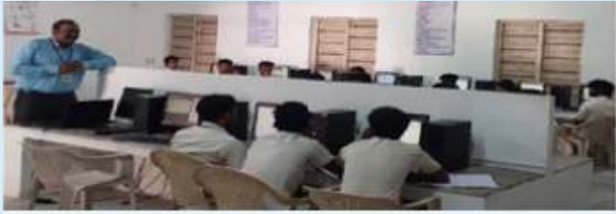
View of participants during the workshop