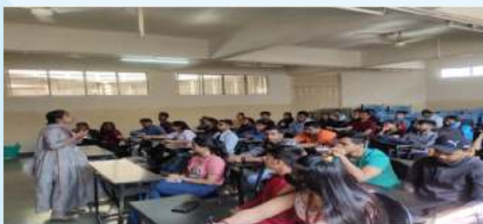
View of speaker and the participants during the program

The IEI Students' Chapter organized a seminar on "How to Write Research Paper" on 15 February 2023.