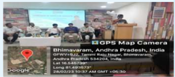
View of the dias during the program

The IEI Students' Chapter of S R K R Engineering College organized an Online Quiz Competition on behalf of National Science Day during 28 February 2023 and an "Expert Talk on Launching of Satellite Vehicles" on National Science Day during 28 February 2023.