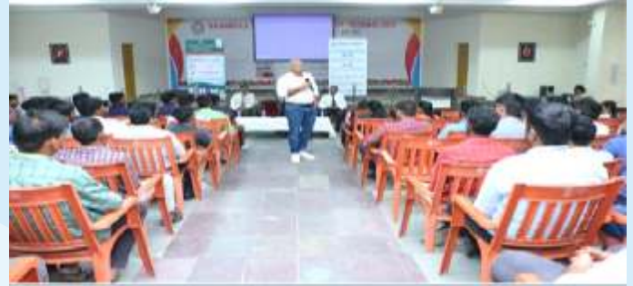
View of the speaker and the participants during the lecture

The IEI Students' Chapter, Mechanical Engineering Department of Manakula Vinayagar