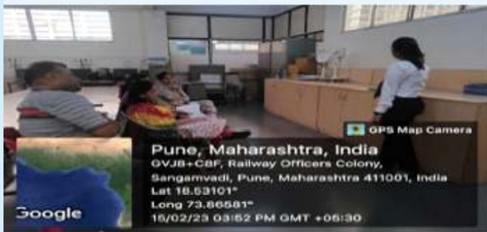
View of participants during the program

The IEI Students' Chapter, Electronics & Telecommunication Engineering Department of AISSMS College of Engineering conducted a Technical Demonstration on 15 February 2023.