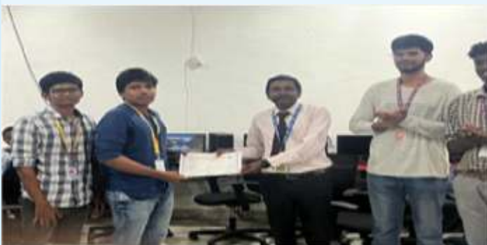
View of participants during the program

The Chapter conducted a contest on "Web Development [Front Eng]" namely "To Create Event Website or Personal Portfolio or Health Tips and Wellness" on 17 February 2023.