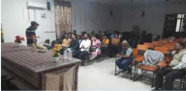
View of the speaker and the participants during the lecture

The IEI Students' Chapter, Electrical Engineering Department of L D College of Engineering organized Expert Lecture on "Application of Controlled Switching in Power System" on 10 January 2023.