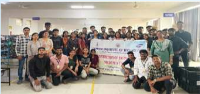
View of participants during the program

They also conducted a webinar on "Understanding FPGAs for Industrial Applications-Step towards Career Path in Semiconductor Industries" on 10 December 2022 and a Quiz Competition on "Inquizitive" on 15 December 2022.