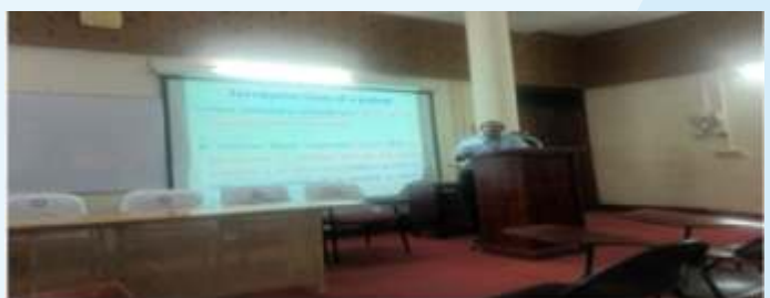
View of speaker during the program

The Chapter also organized an Expert Talk on "An Introduction to Patent Filing" on 27 February 2023.