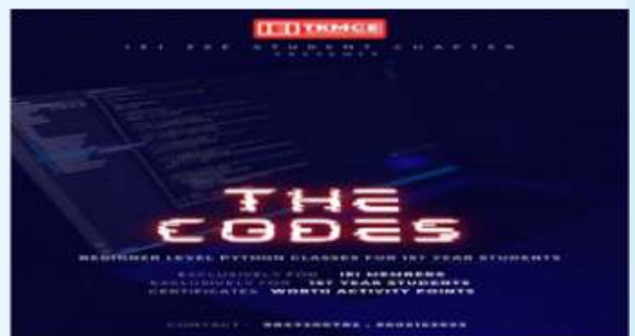
Flyer of the program

The IEI Students' Chapter, Electrical Engineering Department of TKM College of Engineering conducted workshop on beginner lever python programming namely "The Code" on 30 November 2022 for three days for offline and online on 3 December 2022.