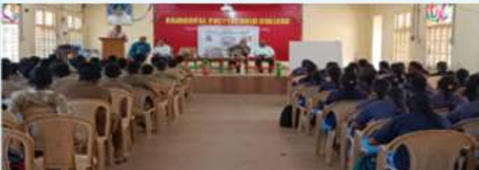
View of the speaker and participants during the program

The IEI Students' Chapter, Rajagopal Polytechnic College organized a Seminar on "Employability Skill, Knowledge & Experience" on 27 February 2023.