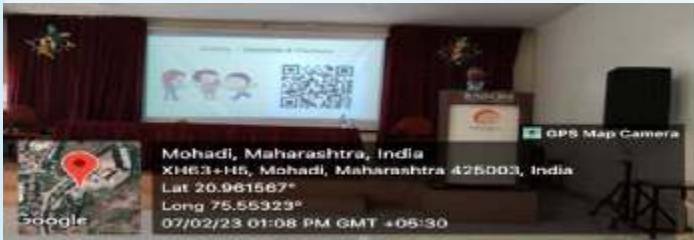
View of the speaker during the talk

The IEI Students' Chapter, CSE-IT-DS-AI Departments of G H Rasoni Institute of Engineering and Business Management organized an Industrial Talk on "Business Incubators for First Generation Entrepreneurs" on 7 February 2023.