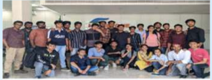
View of the participants

Engineering conducted an Industrial Visit to Hail Stone Innovations on 17 December 2022.