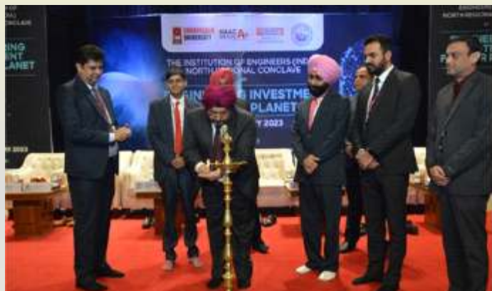
Lighting of the lamp during the inaugural session

Second Regional Conclave of Students' Chapter of The Institution of Engineers (India) was organized on the theme 'Engineering Investments for Our Planet' on 23 February 2023 hosted by Chandigarh University in association with Punjab & Chandigarh State Centre and Ludhiana Local Centre.