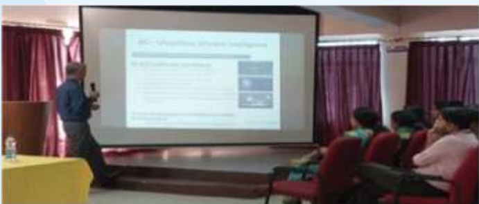
View of speaker during the program

The IEI Students' Chapter, Department of Computer Science & Engineering of Sapthagiri College of Engineering conducted Technical Talk on "5G Technology" on 3 January 2023.