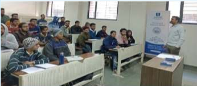
View of the speaker and the participants during the lecture programme

The IEI Students' Chapter of Anand International College of Engineering organized a four day Lecture Series (Technical) on "Programming for Data Science" during 3-6 January 2023.