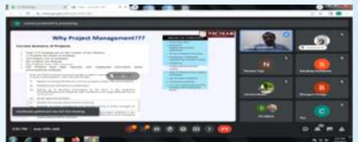
Screenshot of the webinar

The IEI Students' Chapter also organized a webinar on "Scope of Engineering Graduates in the Techno-Management Sector" during 10 February 2023, 20- 22 February 2023.