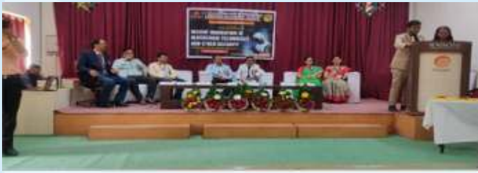
View of the dias during the program

The IEI Students' Chapter, CSE-IT-DS-AI Departments of G H Rasoni Institute of Engineering and Business Management organized an Industrial Talk on "Business Incubators for First Generation Entrepreneurs" on 7 February 2023.