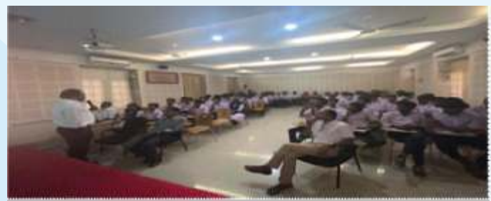
View of the speaker and the audience during the program

The IEI Students' Chapter, Mechanical Engineering Department of NSS College of Engineering and The Society of Automotive Engineers(SAE) organized a Workshop on "Excavators" on 7 March 2023.