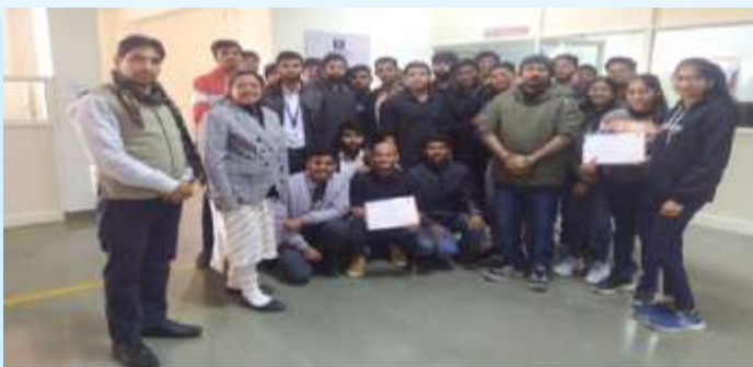
Participants during the program

The IEI Students' Chapter of Anand International College of Engineering organized a One Day Hands-on Workshop on "3D Printing" on 21 January 2023.