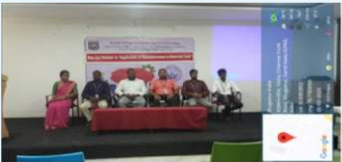
View of the dias during the seminar

The IEI Students' Chapter also organized One Day Seminar on "Application of Nanoelectronics in Electrical Field" on 25 February 2023.