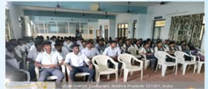
View of participants during the program