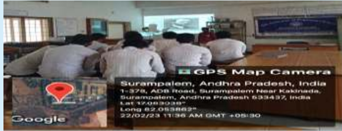
View of participants during the program